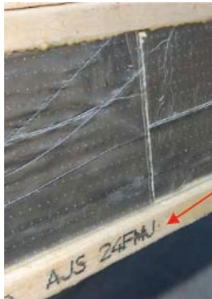
Fire Membrane I-Joist