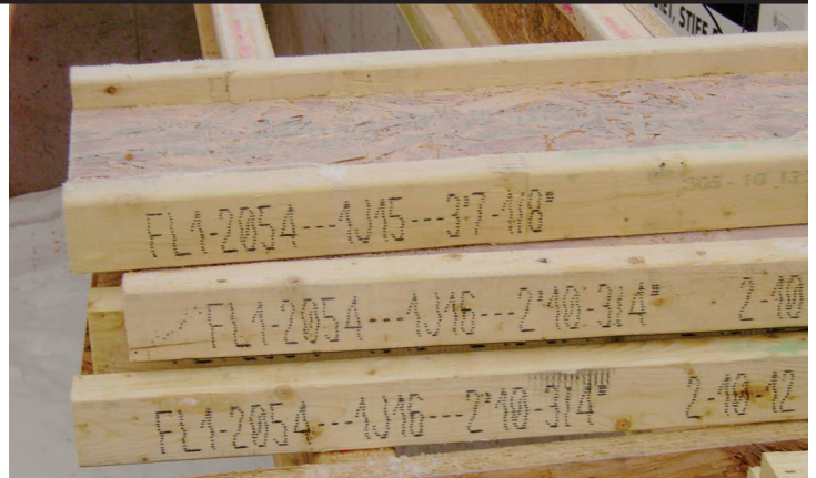
Precision End Trimmed I-Joists with Inkjet Labeling