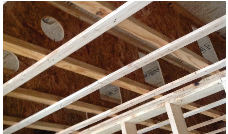
Pre-Cut Holes for HVAC, Plumbing, etc.